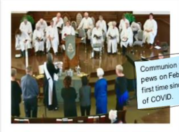
Communion was served in the pews on February 19 for the first time since the beginning of COVID.